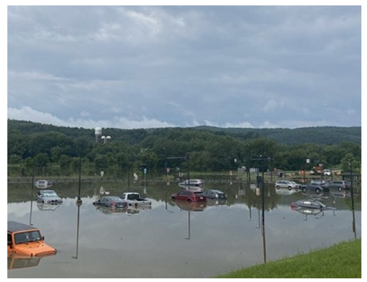
Flooded cars at the Richmond Park and Ride