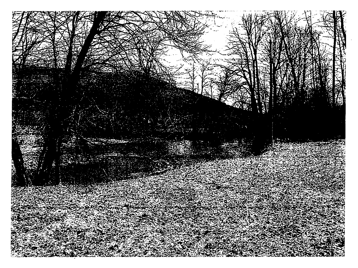
Figure 1. A view of the Batten Kill from the Eastern Stoneham parcel.