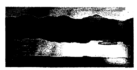
Castanea Foundation, Inc.

Castanea Foundation, Inc. Post Office Box 64 Montpelier, Vermont 05601 phone: (802) 225-1180 fax: (802) 225-1182