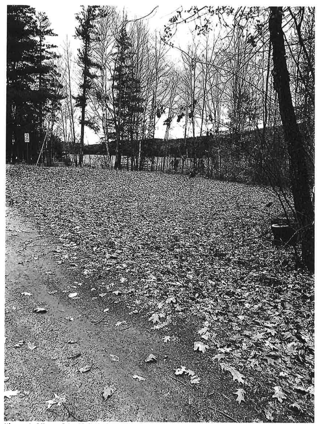
Figure 1. View of the Halls Lake parking area looking to the south with the lake in the background.