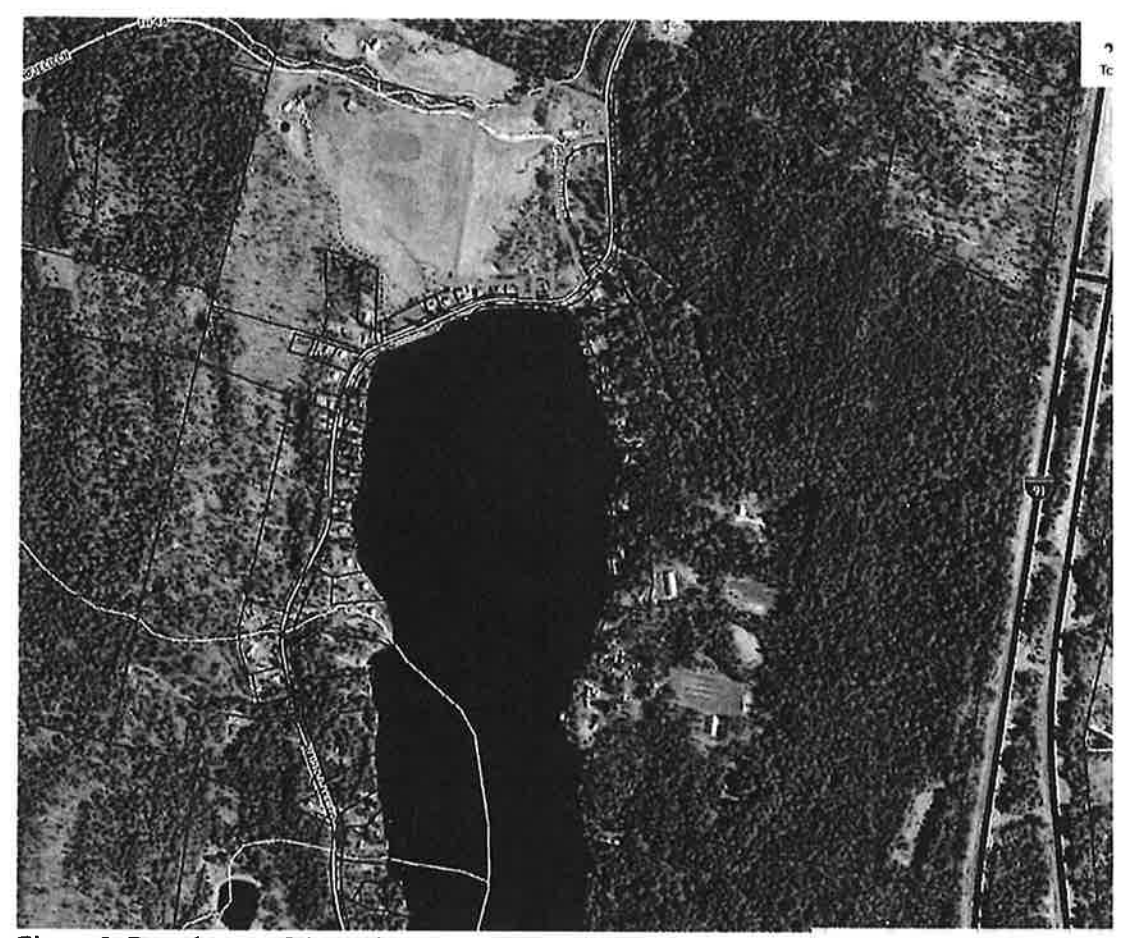
Figure 3. Parcel map of the Dube property on the north end of Halls Lake. The southeast corner of this parcel will be subdivided and conveyed to the Department of Fish & Wildlife